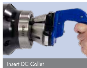
Insert DC Collet