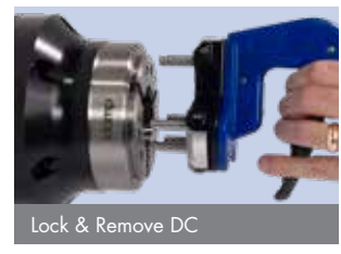
Lock & Remove DC

Kitagawa Power Collet Chuck's tool help provide quick collet changes which minimizes system downtime.