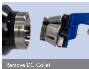
Remove DC Collet