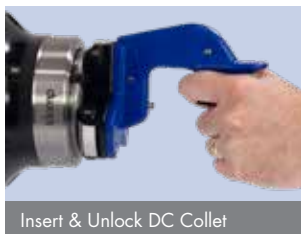
Insert & Unlock DC Collet