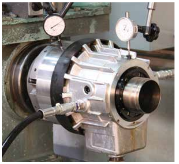
Hydraulic Cylinder Repair